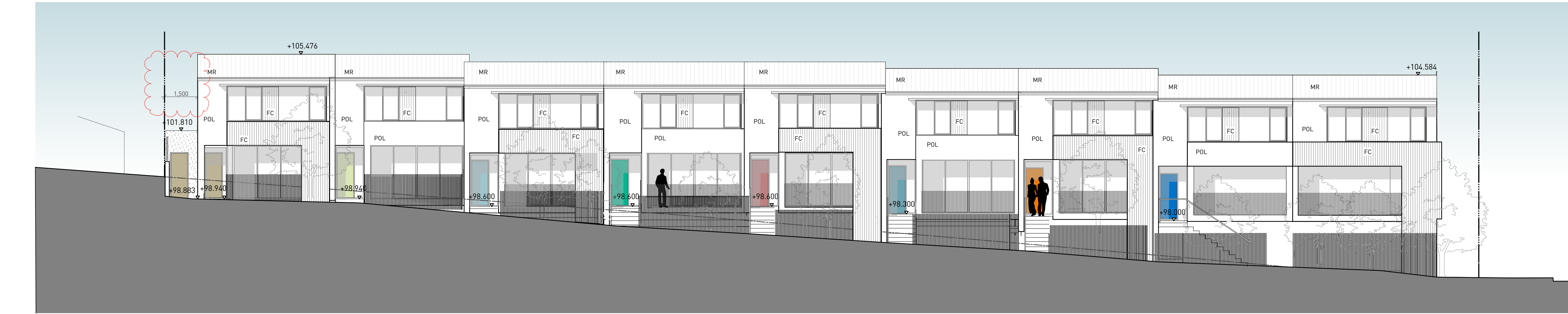
1 LOT 4 - SOUTH-WEST ELEVATION 1:100